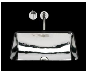
B1218 Plain in Polished Nickel Silver