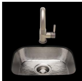
B1513 Hammertone in Satin Nickel