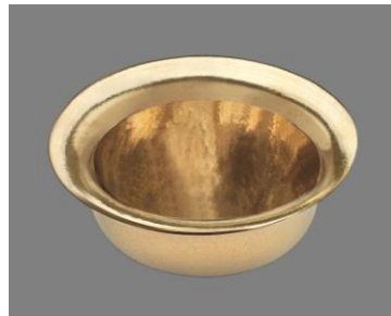
Clarita Wild Bronze